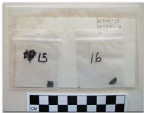
Figure 1 - Catalogued artifacts in bag

Artifacts measuring less than 14 x 9 x 1 cm will be stored in a card catalogue style, according to Borden number and artifact number (Figure 1).