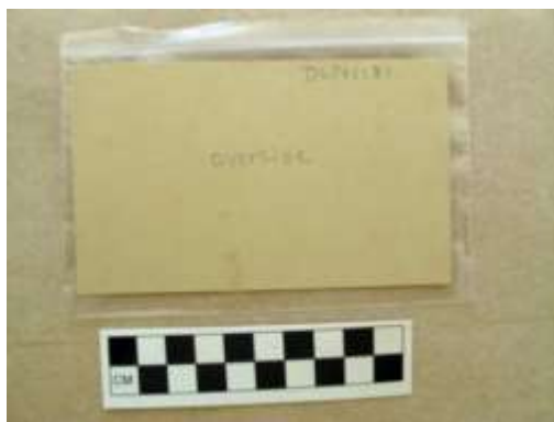
Figure 2 - Oversized artifact catalogue card

Please inform the RBCM if waterlogged material is anticipated or found. The Collection Manager can advise about in-field conservation. For long-term conservation, the RBCM often sends this material off-site. Hard costs, such as shipping and treatment, are the responsibility of the depositor. Currently, the RBCM sends waterlogged material out of province for conservation treatments, so be sure to mention this fact in your permit applications if you anticipate recovering waterlogged material.