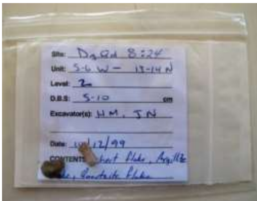
Figure 4 - Supplemental information