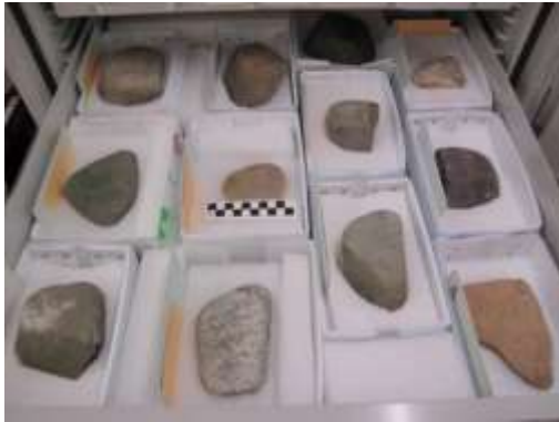
Figure 3 - Oversized artifacts in separate drawer