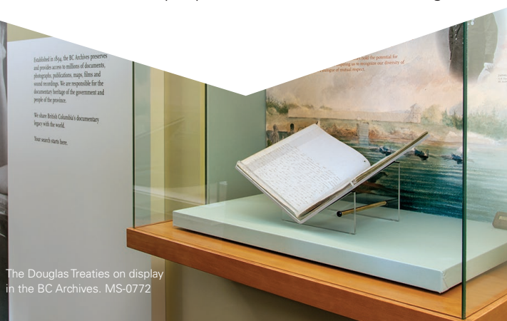
The Douglas Treaties on display in the BC Archives. MS-0772