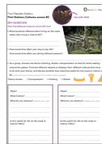
3 First Nations cultures Across BC (all of gallery)