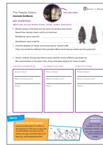
1 Ancient Artifacts