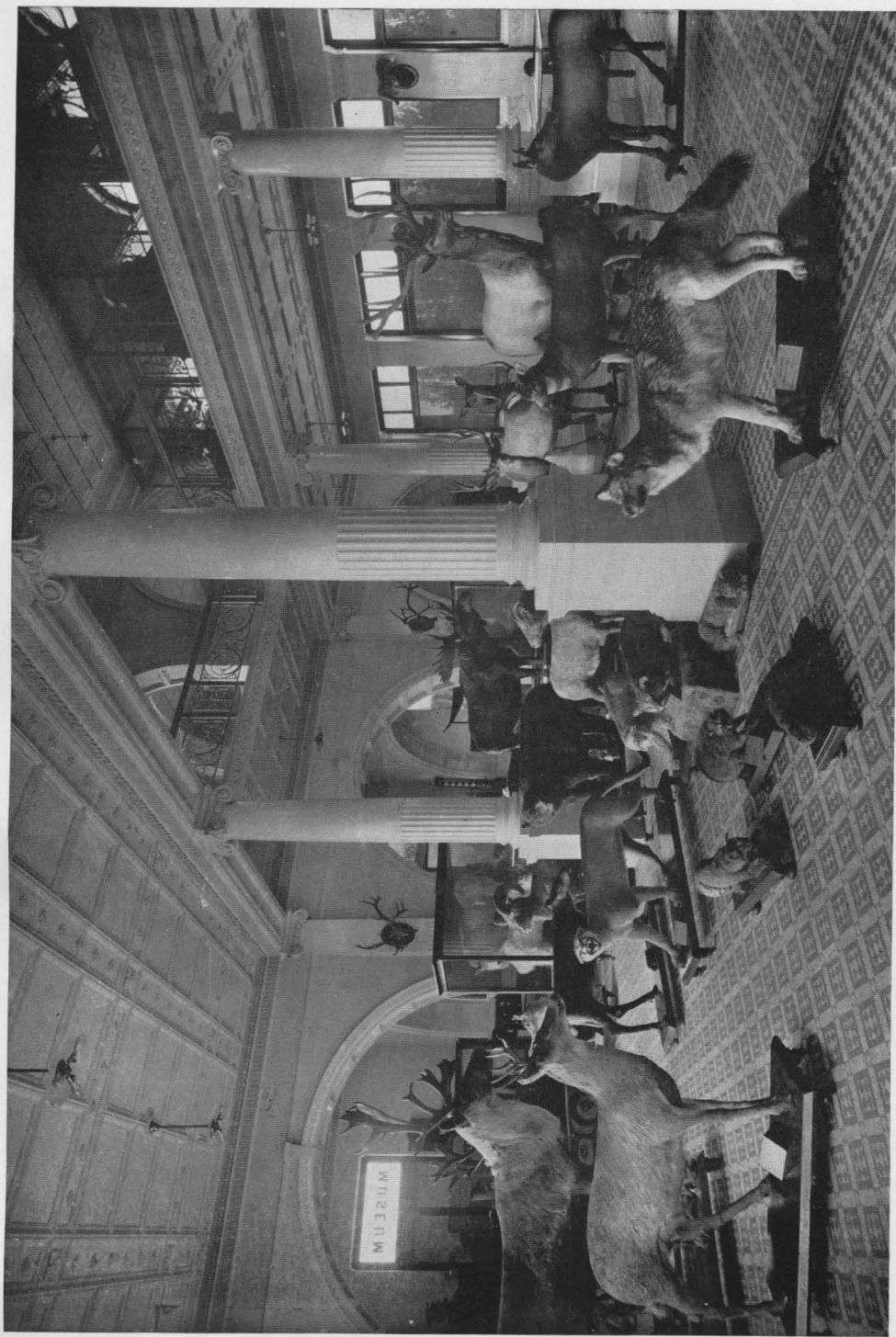
MAMMALS IN PROVINCIAL MUSEUM, VICTORIA, B. C.