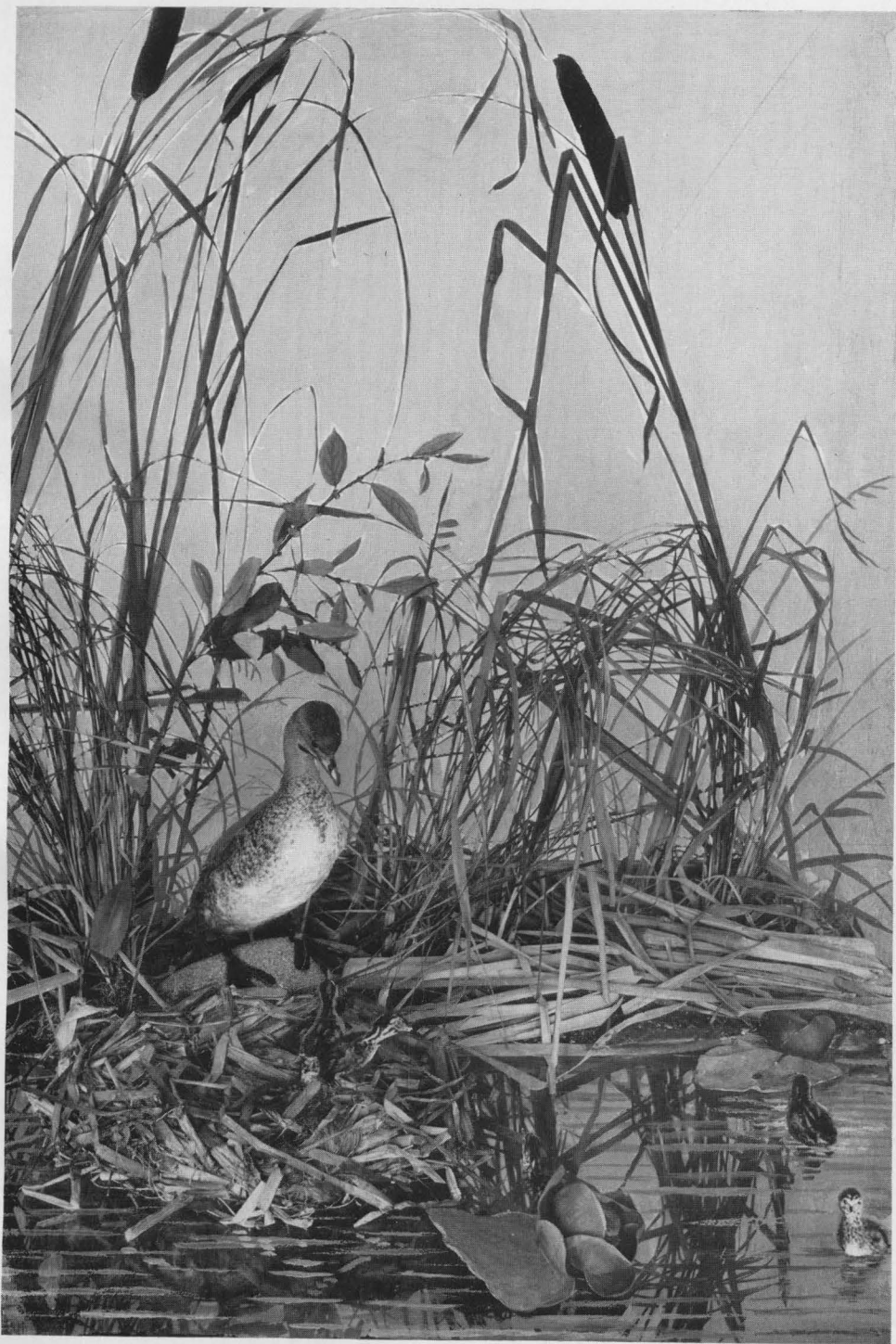
PIED-BILLED GREBE. PODILYMBUS PODICEPS (LINN.). Group in Provincial Museum, Victoria, B. C.