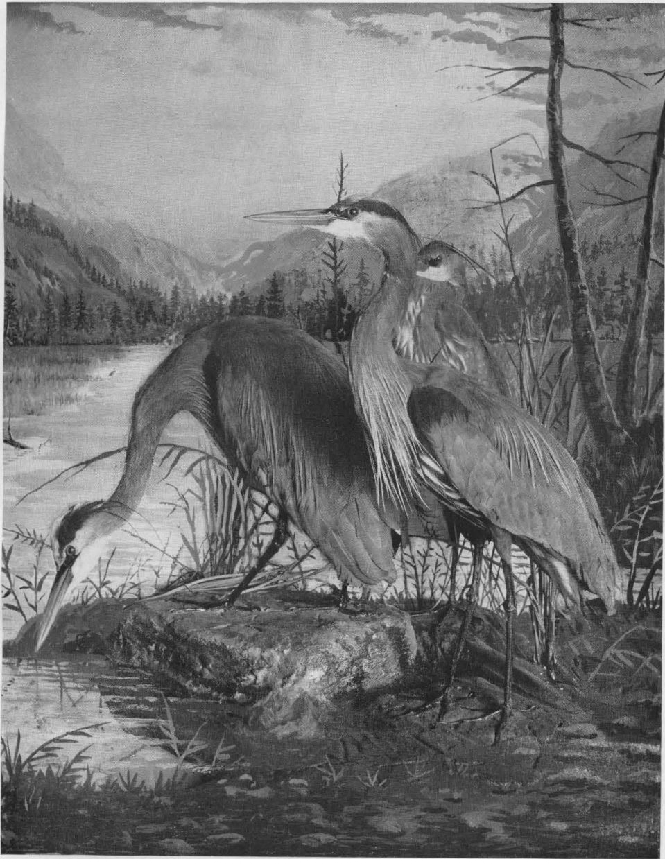
NORTH-WEST COAST HERON. ARDEA HERODIUS FANNINII (CHAPMAN). Group in Provincial Museum, Victoria, B. C.