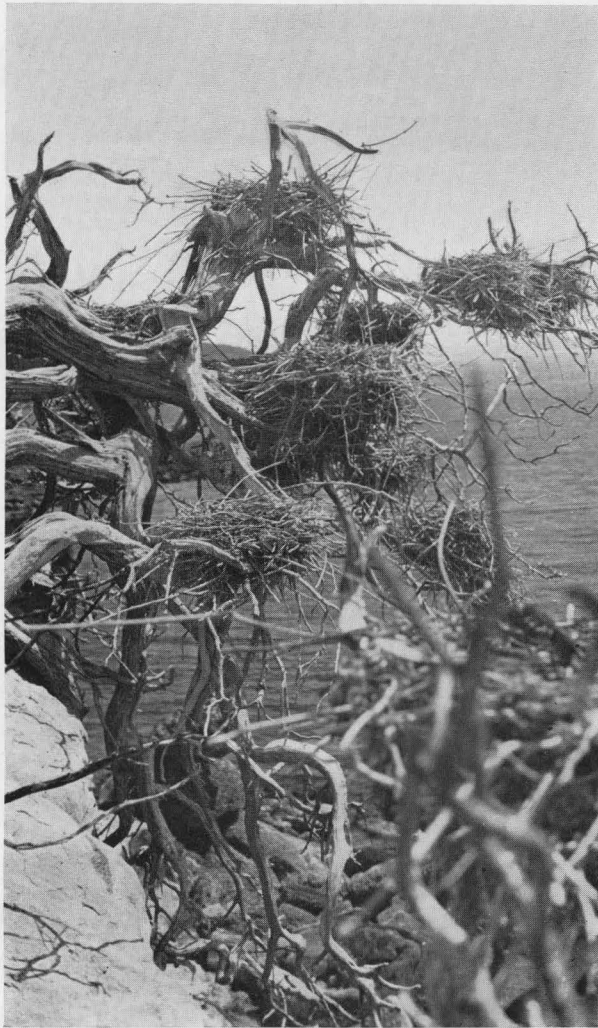
Fig. 3.—Group of eight nests, Phalacrocorax auritus , Ballingall Islet, Trincomali Channel, British Columbia.