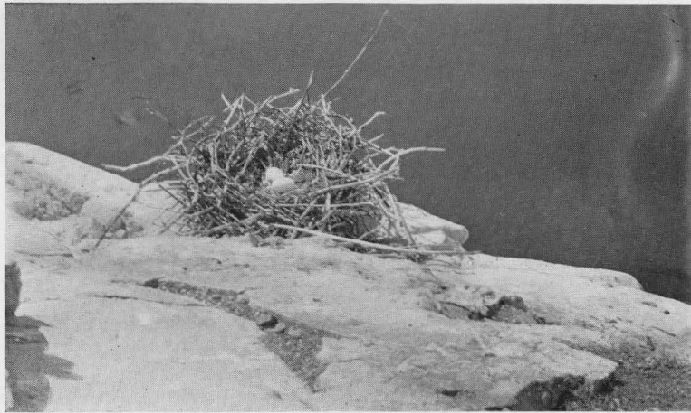
Fig. 2.—Single nest of Phalacrocorax auritus , Bare Island, British Columbia.