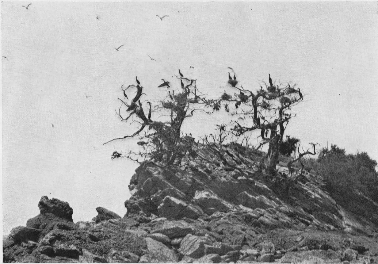
Fig. 4.—Nesting colony of Phalacrocorax auritus , Ballingall Islet, Trincomali Channel, British Columbia.