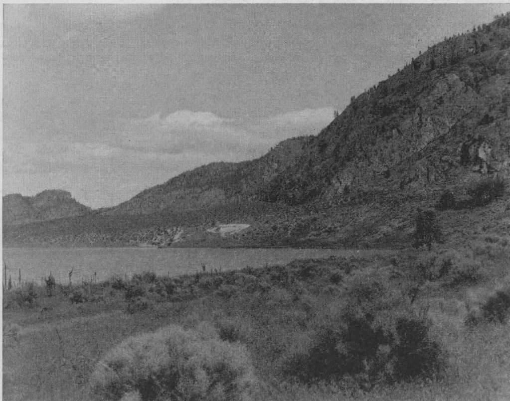
Fig. 2. Osoyoos arid region looking north from camp-site; Osoyoos Lake on the left.

A large adult was observed in the dry forest near the summit of Anarchist Mountain. The animal was travelling by day, down one of the many trails which interlace this area.