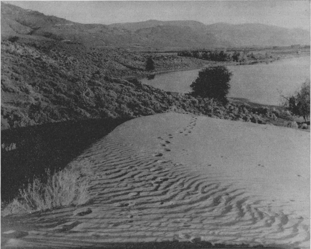
Fig. 1. Osoyoos arid region looking south; camp-site in copse in middle distance; foot of Anarchist Mountain on the left.

Bats were not numerous in the area east of Osoyoos Lake, to which our bat-hunting was confined. One of nine bats observed, when collected, proved to be of this species.