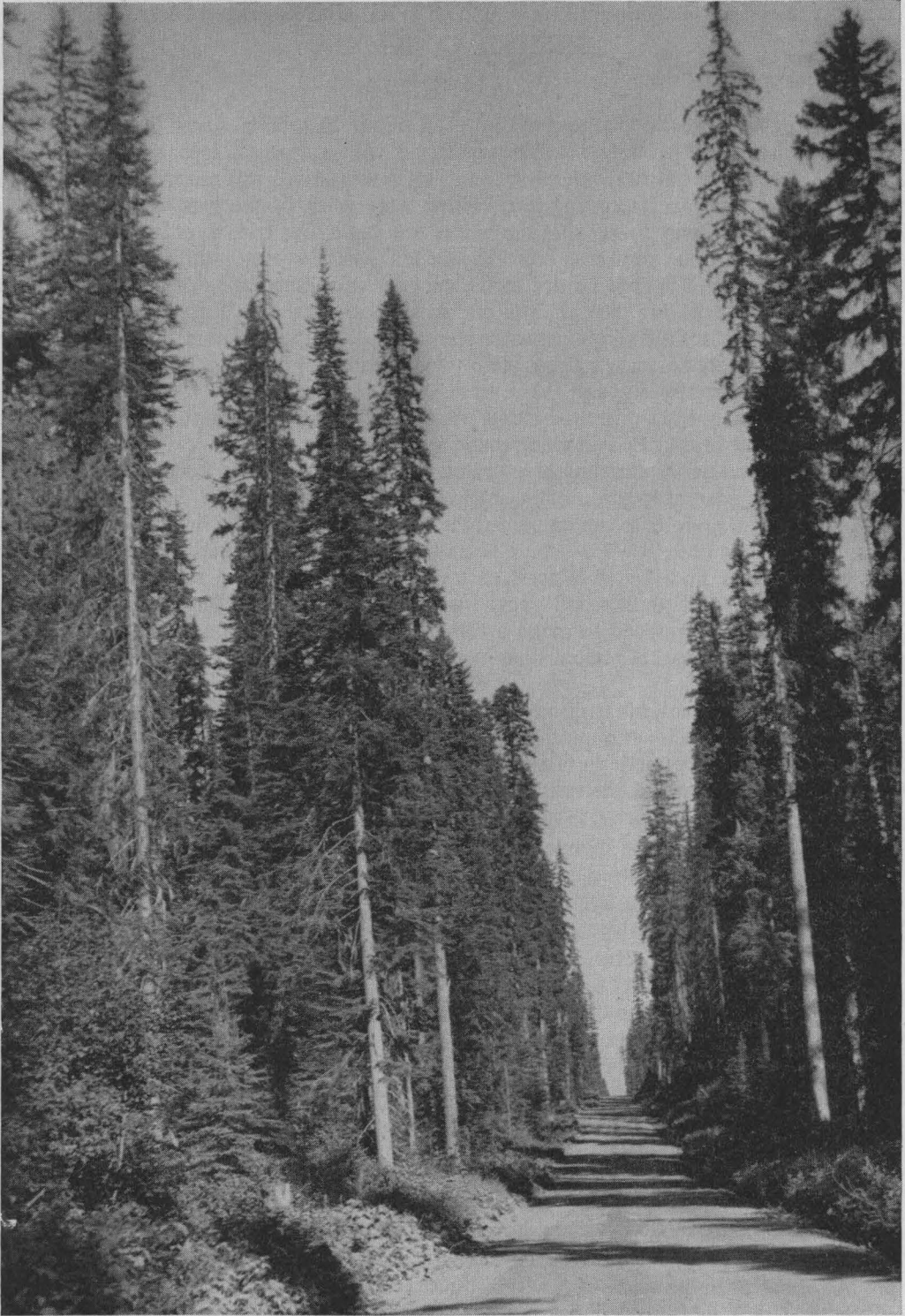
Fig. 1. Looking north-west on the Big Bend Highway near Donald. Engelmann spruce and thimble-berry border the road.