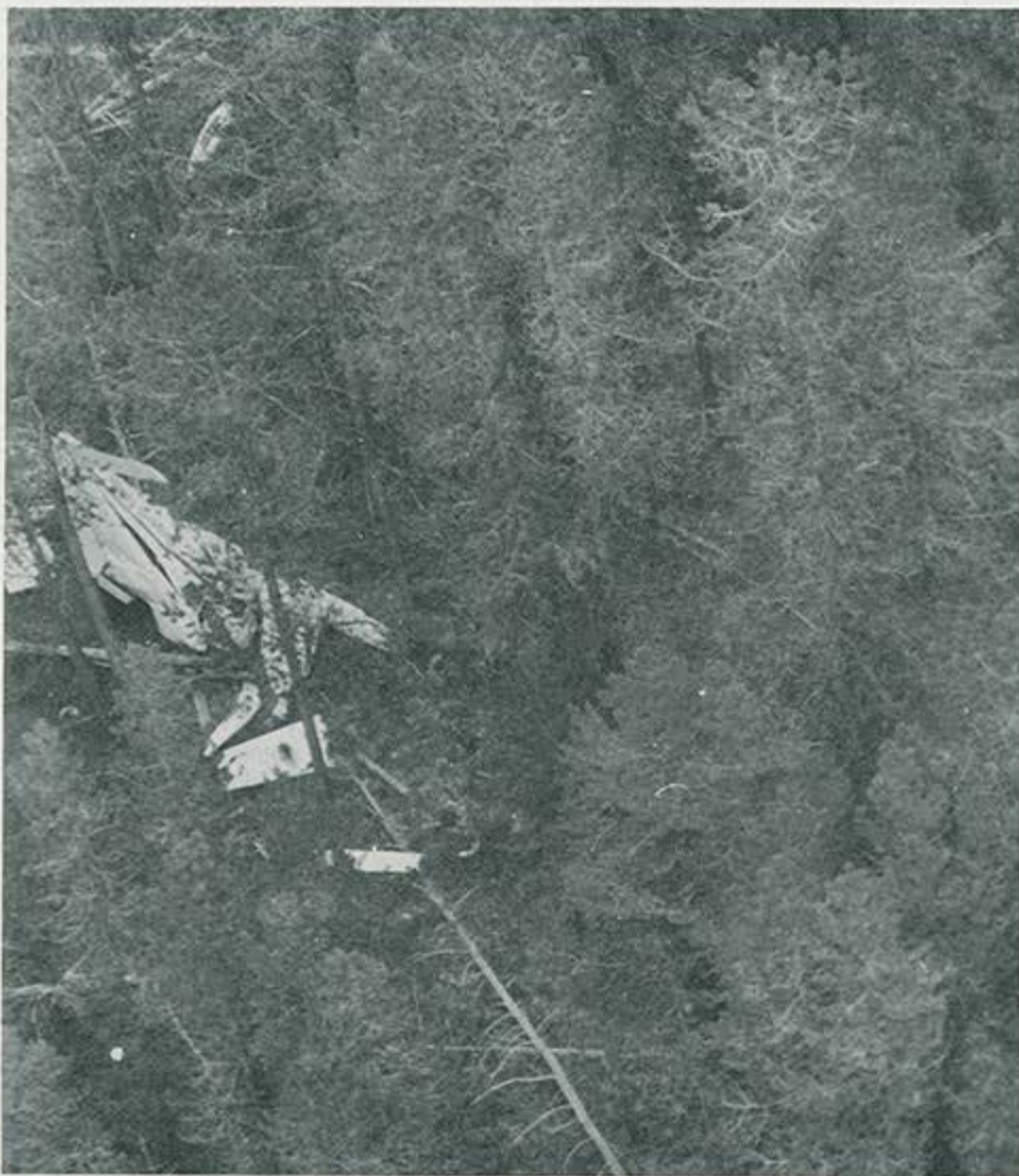
It takes an experienced eye to spot downed aircraft in the forests of British Columbia.

PEP is working closely with Mountain Rescue Groups in various parts of the Province and also with the various Avalanche Co-ordinators in the Ministry of Highways and Public Works. A program to identify cave rescue capabilities in the Province has also been started.