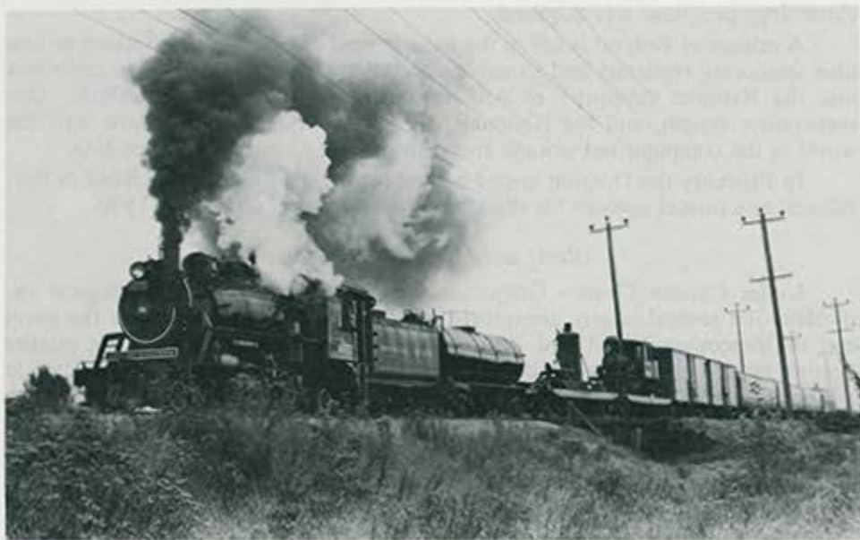
The Museum Train is often almost as popular an attraction as the displays it carries to all parts of the Province.

The Museum continued its well-known publishing program, adding to its titles two popular wildflower books, a Handbook in colour on mushrooms, Museum Manuals on collecting fish and controlling insects in collections, Occasional Papers on catkin-bearing plants and archæology in the Gulf Islands, and in the new Heritage Record Series, a small selection of papers from a natural history conference. Rising costs encouraged us to co-publish three titles with other agencies, another Ministry, the Federal Government, and a non-profit society.