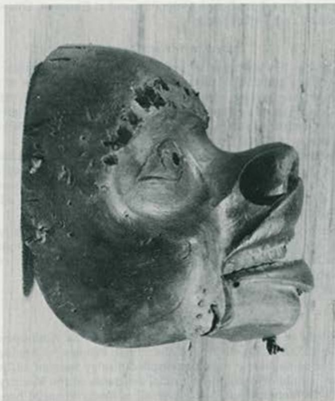
A Haida bear mask, before and after careful conservation treatment by Museum staff.