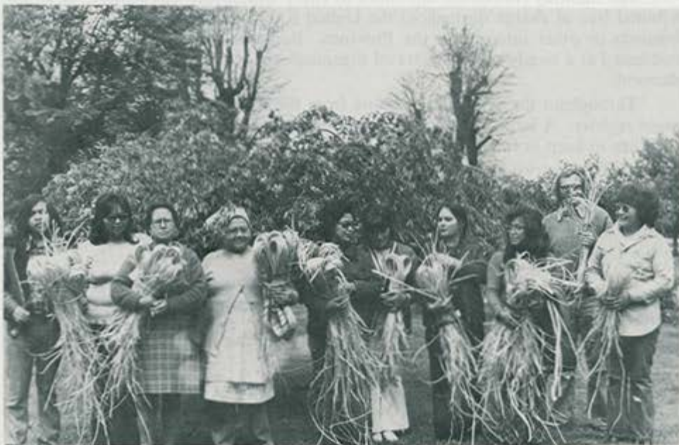
Making sure that traditional crafts survive, a weaving class has already mastered the art of splitting roots.

The First Citizens' Fund Advisory Committee evaluates all applications for assistance directed to the Fund, established under the Revenue Surplus Appropriation Act, 1969 : "to help expand and contribute support to projects involved with the advancement and expansion of the culture, education, economic development, and position of persons of the North American Indian race who were born in and are residents of the Province of British Columbia."