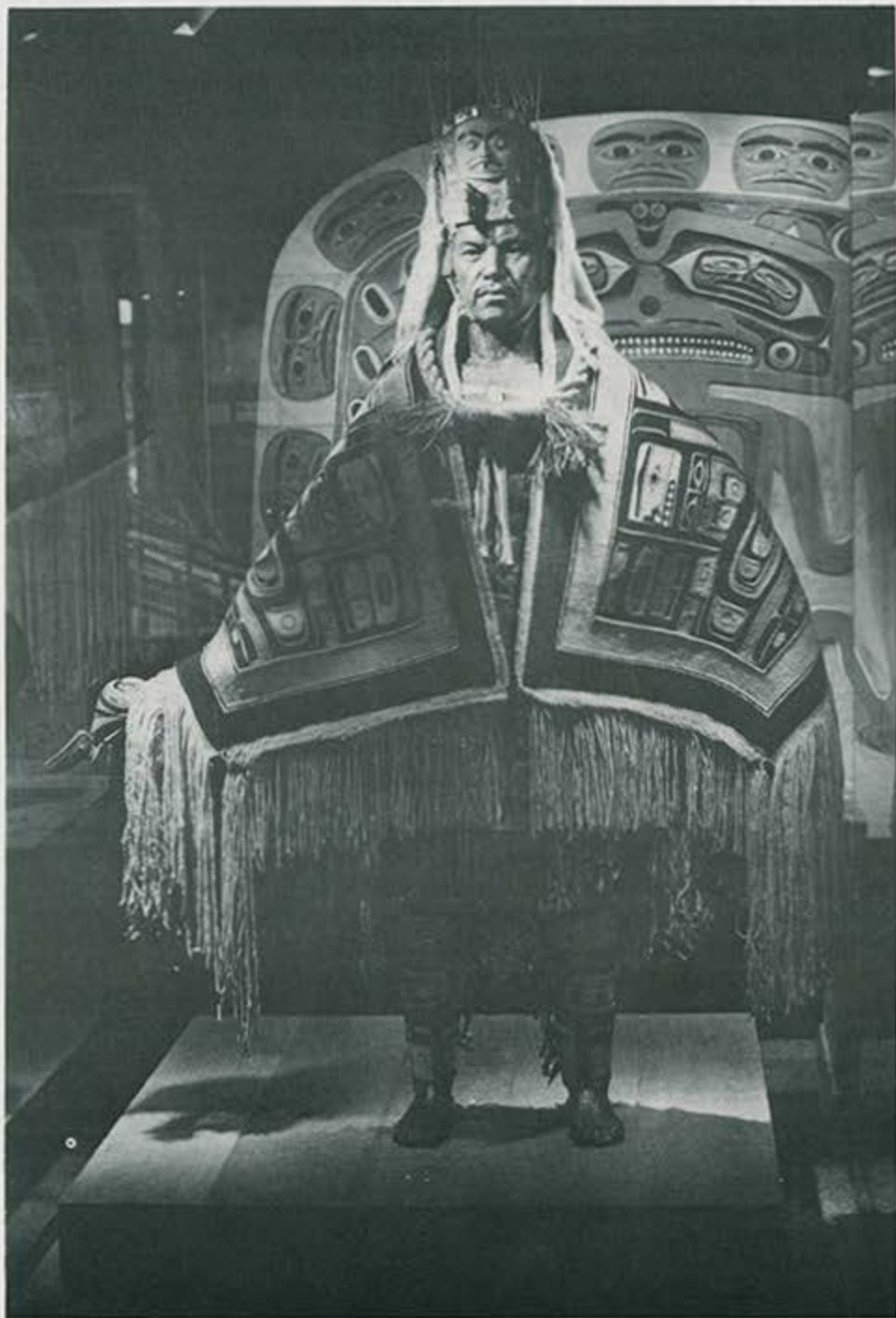
A Tsimshian Chief in full traditional dress, one of the colourful exhibits in the new Anthropology Gallery.