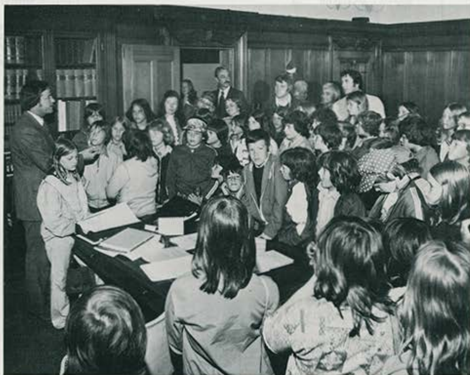
Guided tours of the Parliament Buildings often feature a meeting with an M.L.A. or Cabinet Minister. In this case, a school tour has a chance to ask some questions of Premier Bill Bennett in his office.

Efforts for the year have been particularly concentrated on revising and updating the Tour Guide Manual , the basic resource book for the program. Guide training is ongoing for all staff members in that research constantly reveals new information relevant to the historical material.