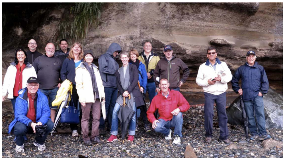
BC Heritage Branch and site management tour group Muir Creek Beach, 2017-06