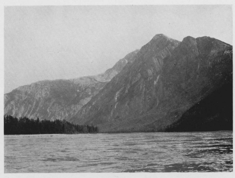
MOUNT SELWYN, WHERE THE PEACE RIVER PASSES THROUGH THE ROCKY MOUNTAINS.