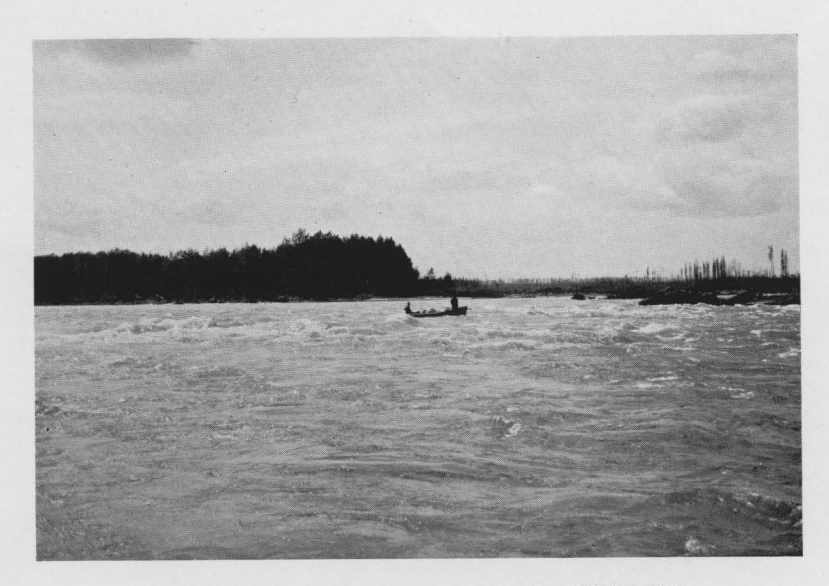
FINLAY RAPIDS, WHERE THE PARSNIP AND FINLAY JOIN TO FORM PEACE RIVER.