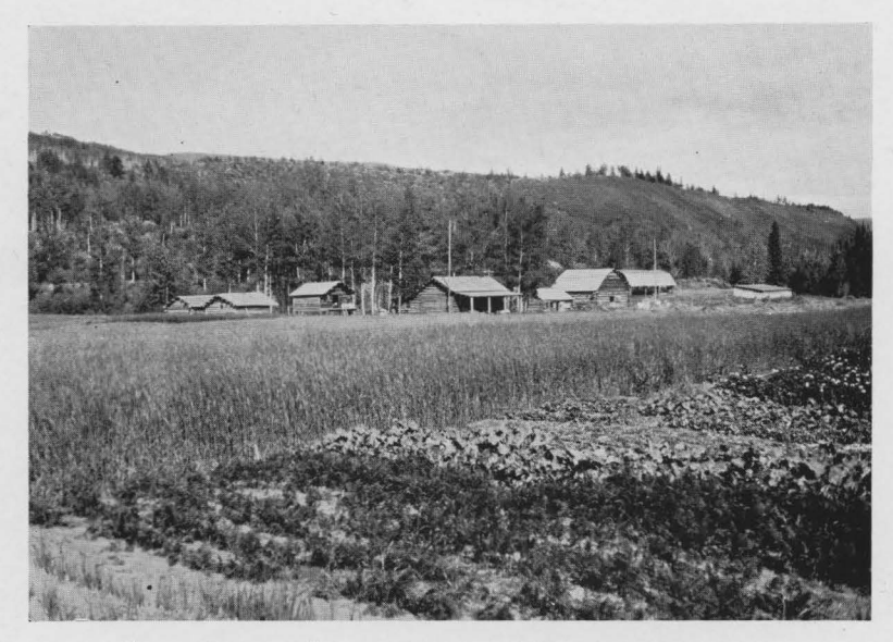
" PEAVINE FLATS," A BEAUTIFUL FRONTIER FARM FAR UP THE SOUTH PINE RIVER VALLEY.