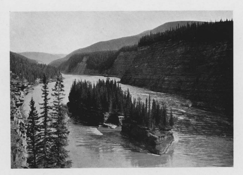
LOOKING DOWN PEACE RIVER CANYON, SHOWING COAL-SEAMS.