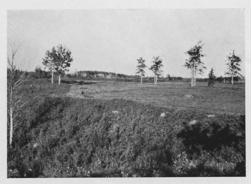
TYPICAL PARK LAND 20 MILES WEST OF DAWSON CREEK, B.C.