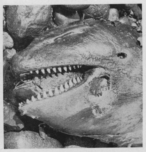
Fig. 6. Condition of teeth in juvenile male killer whale. (No. 20.)