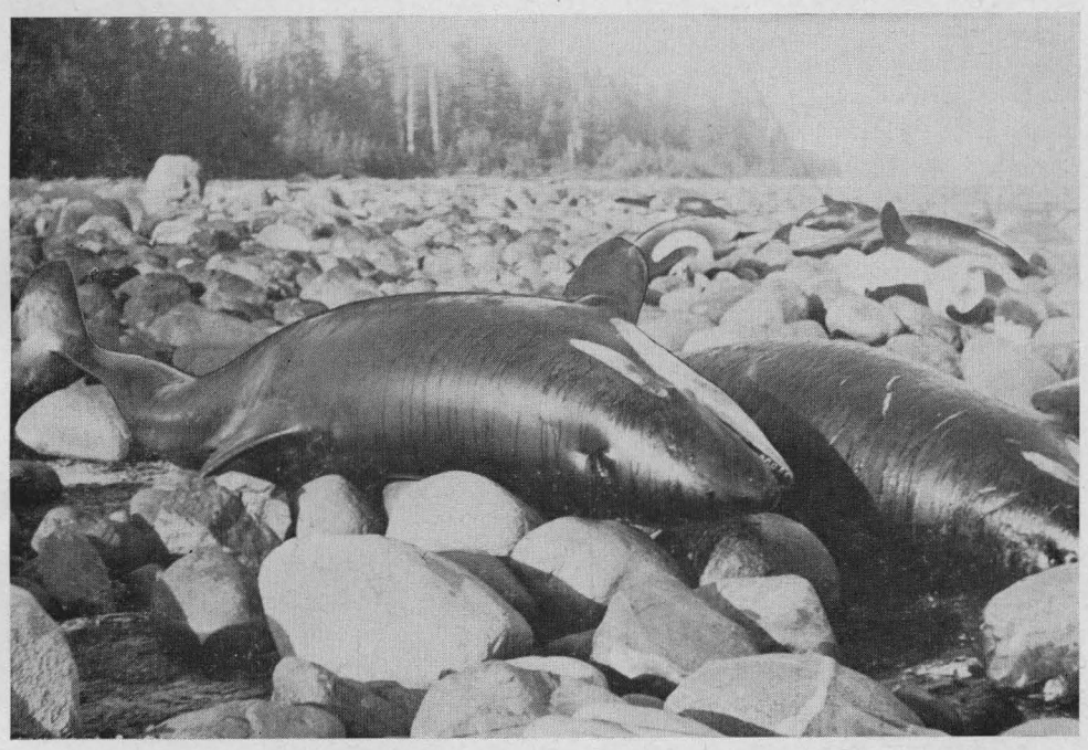
Fig. 2. In foreground, two female killer whales, Nos. 17 and 16. \,