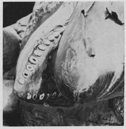
Fig. 8. Condition of teeth in adult killer whale, Estevan Point, July 4th, 1945.