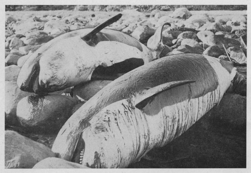
Fig. 4. Ventral aspect of two female killer whales.