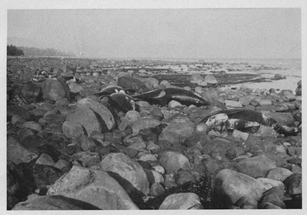
Fig. 1. Killer whales stranded at Estevan Point; view looking east toward Boulder Point.