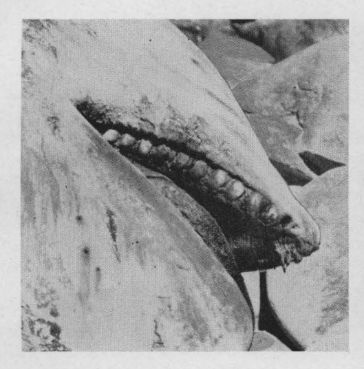
Fig. 5. Condition of teeth in adult female killer whale. (No. 13.)