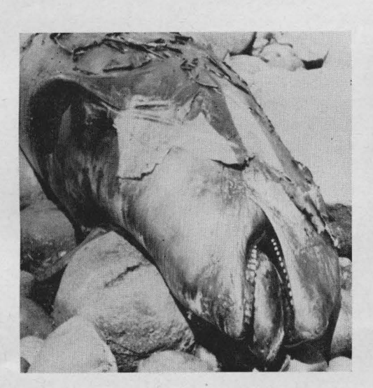
Fig. 7. Adult female killer whale; stranded June 13th, photographed July 4th, 1945.