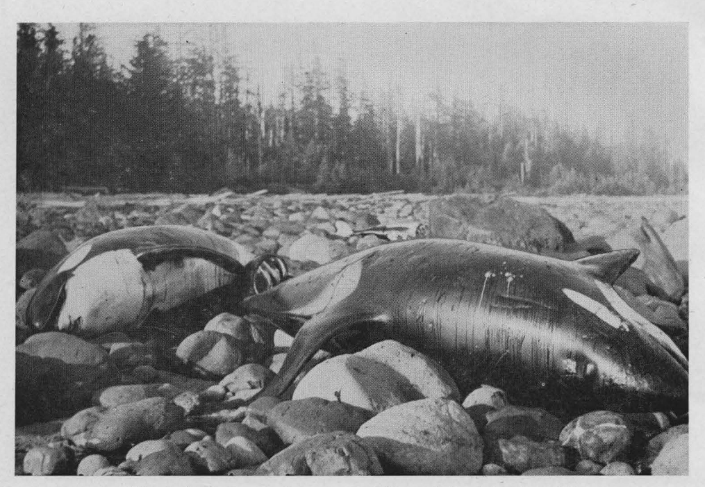
Fig. 3. In foreground, two male killer whales, Nos. 6 and 7.