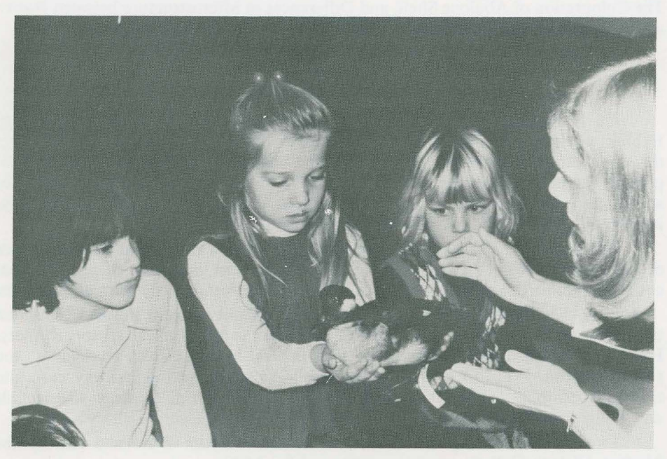
School children at a natural history program in the museum; the faces tell their own story.

Four small travelling exhibits funded by the National Museums Corporation were produced in 1977 to travel to community museums in British Columbia. Six exhibits were installed in the temporary gallery. Three originated in this museum, while others came from Alaska, Alberta, and Nova Scotia.