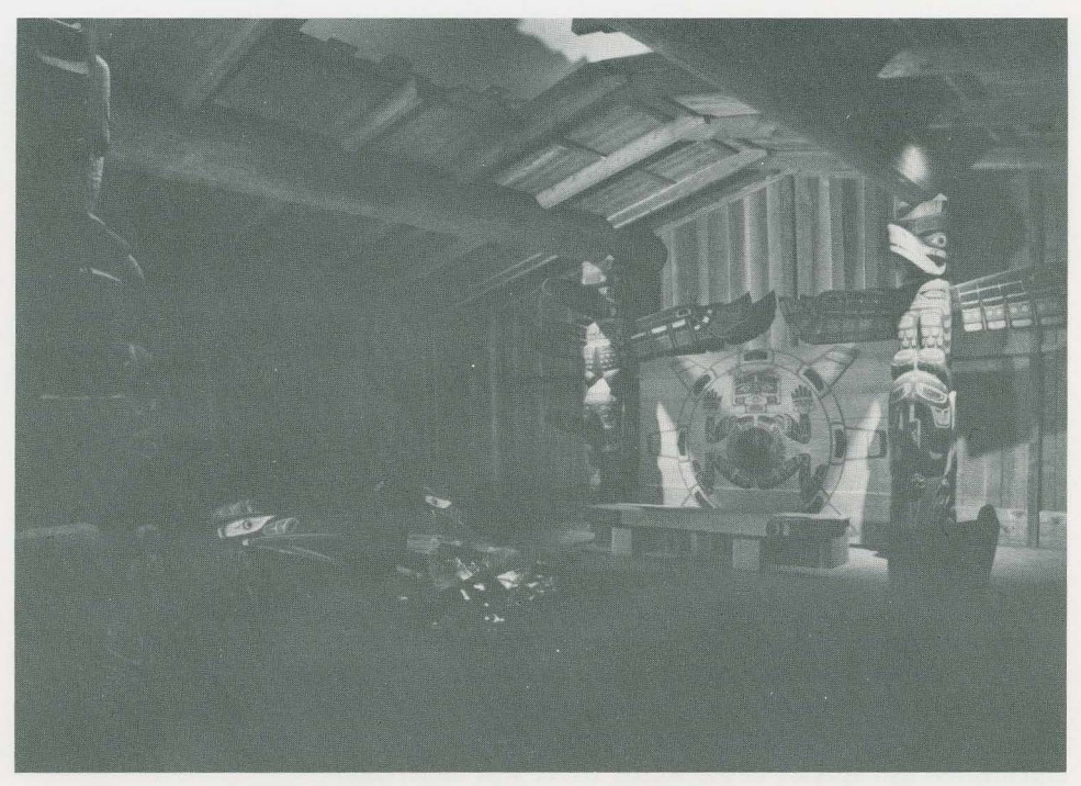
Interior of Chief Kwakwabalasami's (Jonathan Hunt) house in the First Peoples gallery (BCPM photo).

A number of temporary and travelling exhibits were assembled during the year. Nearly all the museum's Chilcotin baskets were displayed in the Friends of the Provincial Museum Gallery. An audio-visual presentation was also prepared to accompany this exhibit. The Legacy , an exhibit of contemporary British Columbian Indian Art, completed its cross-country tour in the Maritimes this spring. In the fall an exhibit of Carrier and Chilcotin photographs illustrating traditional lifeways was sent on tour of the area occupied by those tribes. A sound track in both Carrier and Chilcotin languages, prepared by native speakers, accompanied the display.