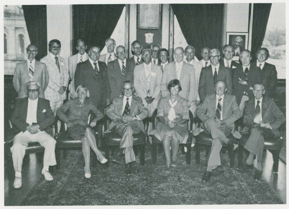
Delegates to the fourth annual Conference of Canadian Electoral Officers meeting at the Parliament Buildings in Victoria.

The year ended with the prospect of a by-election early in the new year, the Member of Oak Bay having indicated that he would be resigning.